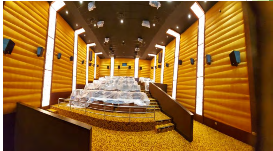
WOW CINEMA, BARKA – GOLD CLASS