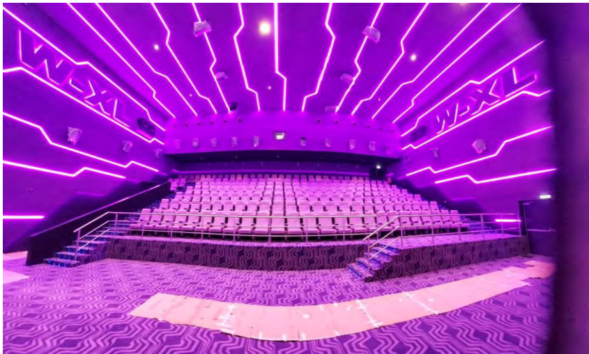
WOW CINEMA, BARKA – PLF CINEMA