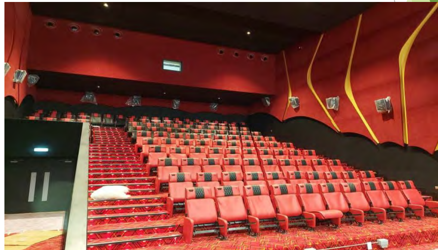
WOW CINEMA, BARKA – AUDI 1-3