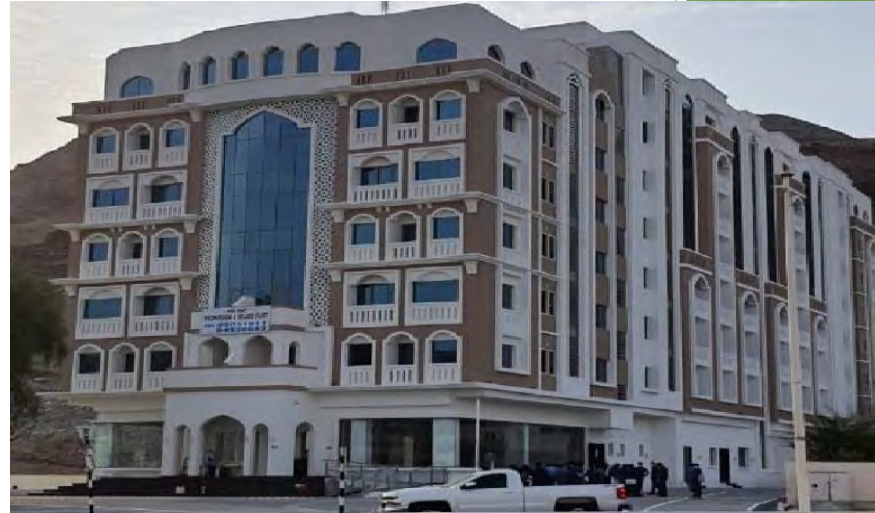
AL SERKAL BUILDING, RUWI