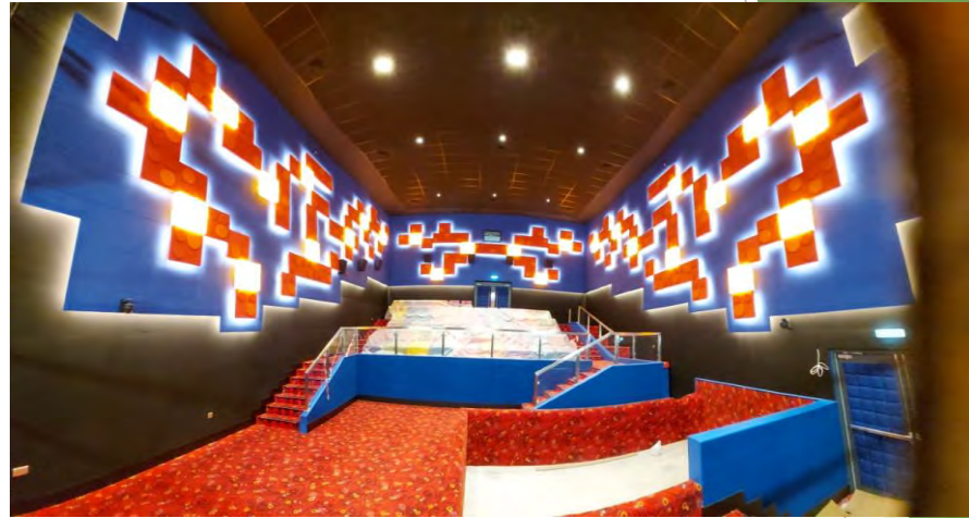
WOW CINEMA – KIDS CINEMA