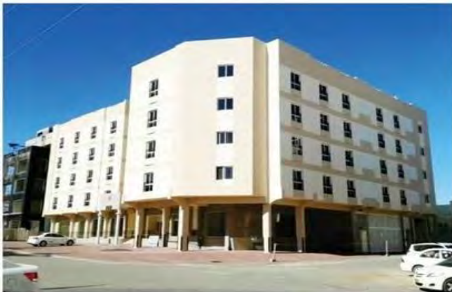
Residential Commercial Building, G+4, Bait Fatma – USD 3.12 Million