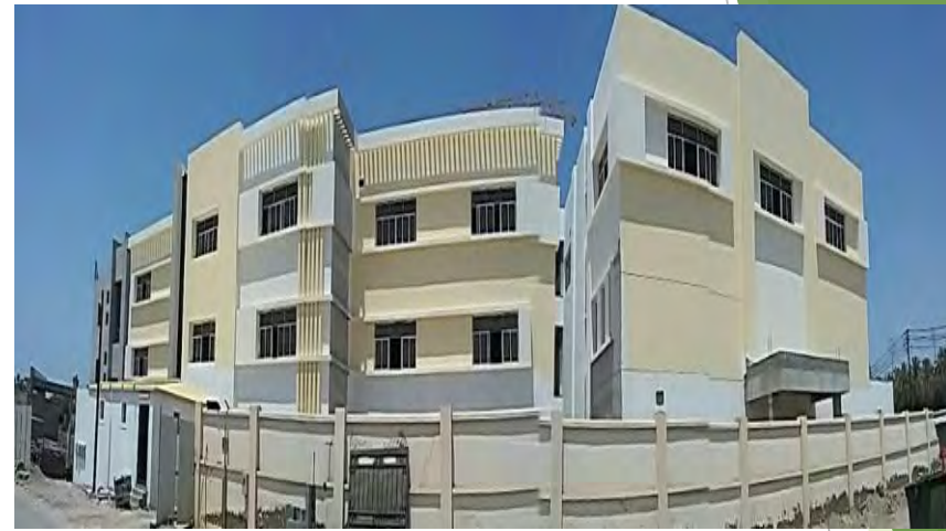
Construction of International School at Seeb – USD 11.83 Million