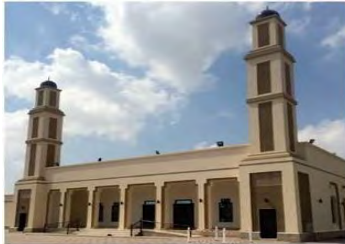
Mosque at Sohar – USD 1.12 Million