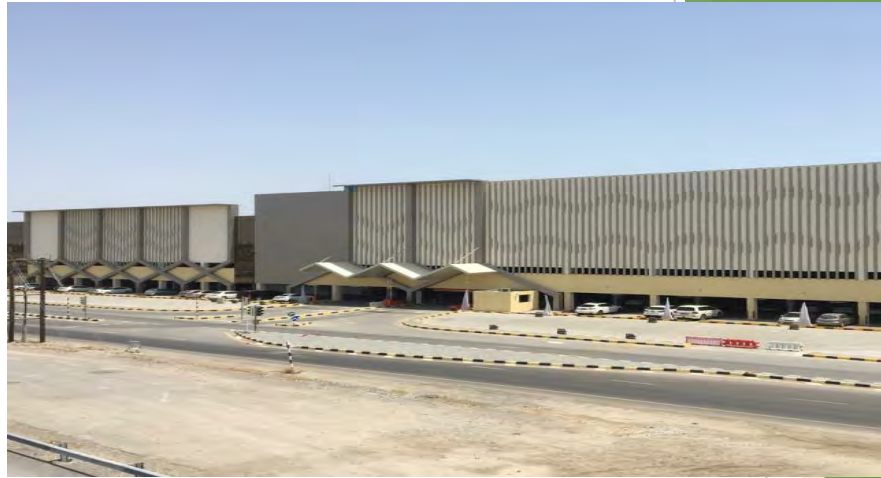
BARKA GRAND CENTER