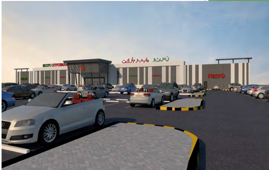
NESTO HYPERMARKET AT SAHAM