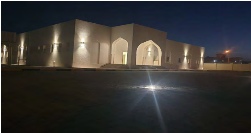
RENAL DIALYSIS CENTER, AL AMERAT