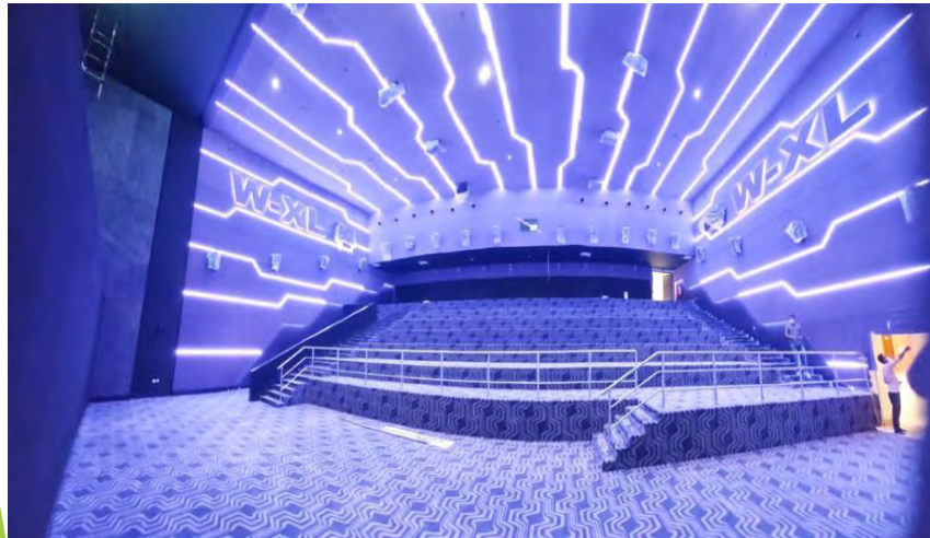
WOW CINEMA, BARKA – PLF CINEMA