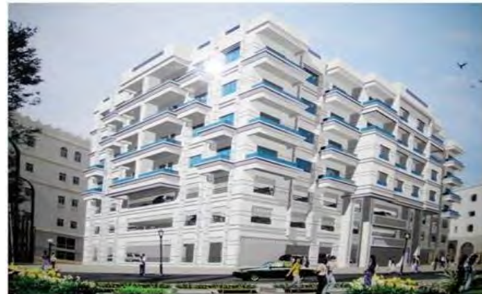
Construction of Commercial cum Residential & Car Park Building at Al Khuwair – USD 5.20 Million