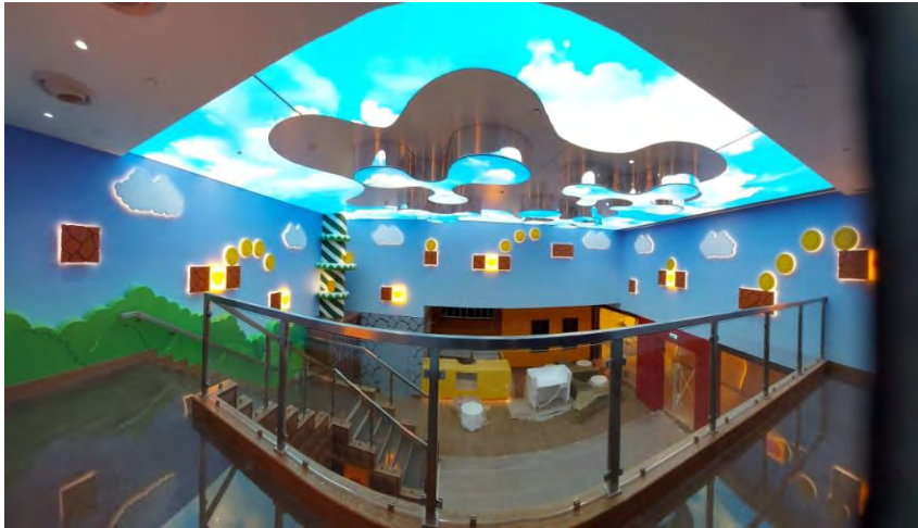
WOW CINEMA – KIDS LOUNGE