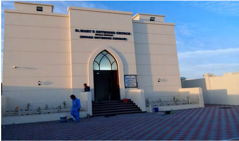
INDIAN ORTHODOX CHURCH, GHALA