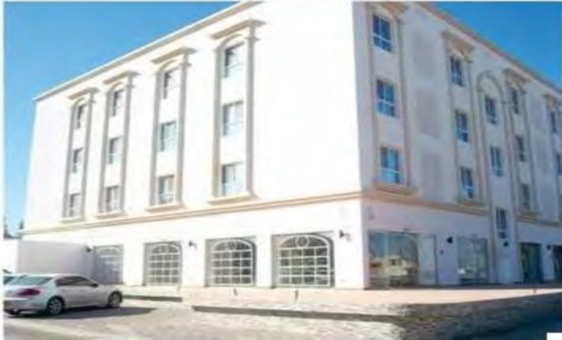
Residential/Commercial Building at Darsait – USD 1.30 Million