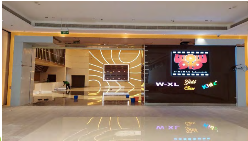
WOW CINEMA AT BARKA