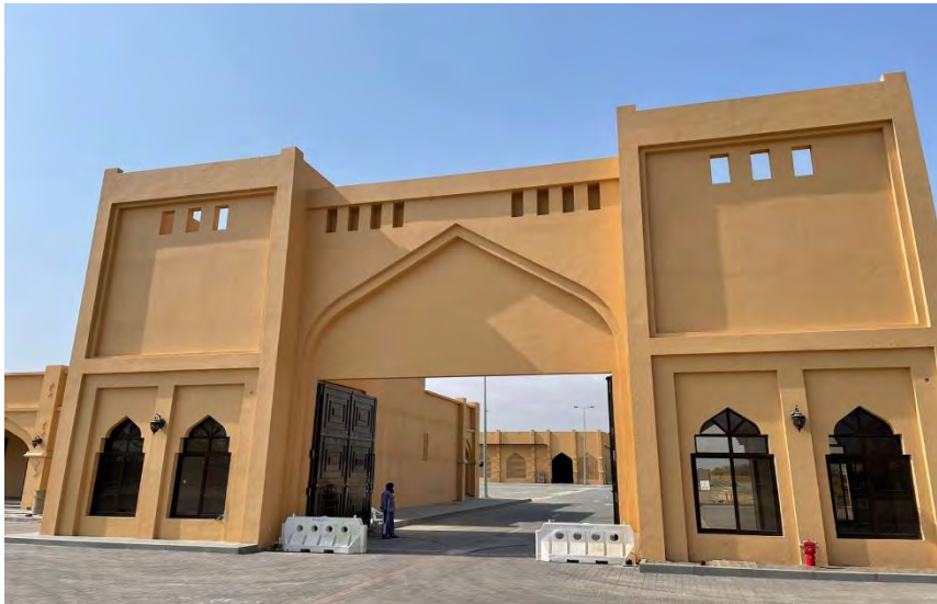
SOUQ AT HAFEET SAHAM