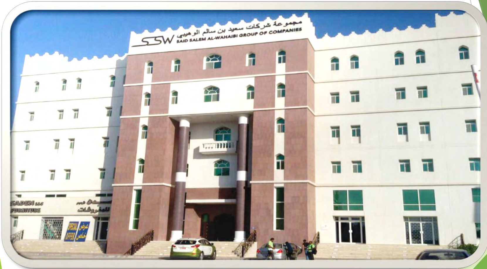
SSW GROUP - HEAD OFFICE BUILDING AT MSQ

SAID SALEM AL-WAHAIBI GROUP OF COMPANIES