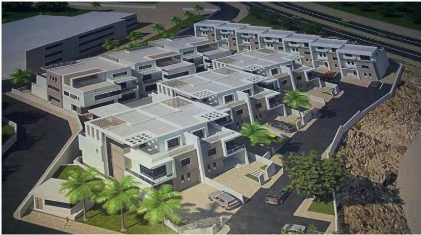
Construction of 16 Villas at Qurum – USD 4.68 Million