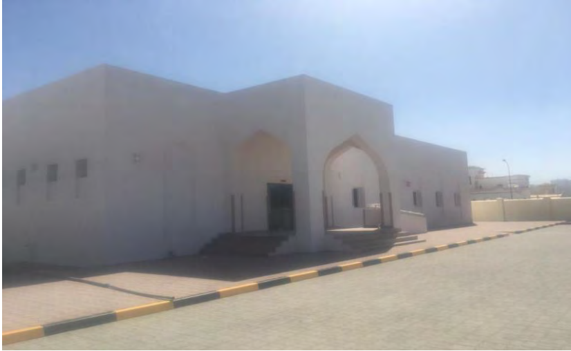
RENAL DIALYSIS CENTER, AL AMERAT