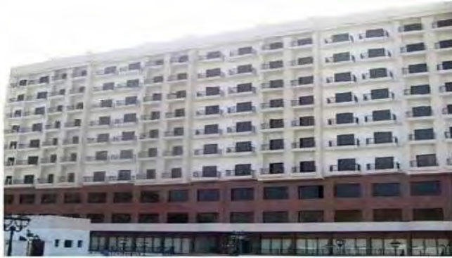
Hatat Complex- B at Wadi Adai – USD 18.20 Million