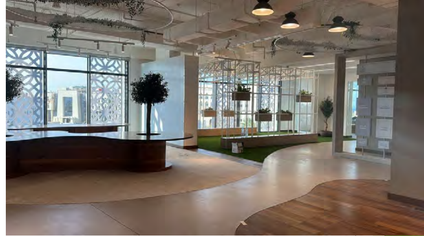
REFURBISHMENT OF RAM BUILDING – AL KHUWAIR