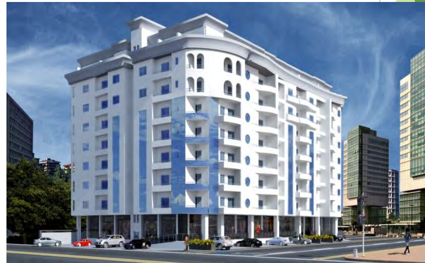
Construction of Residential / Commercial Building at Al Khuwair – USD 14.30 Million