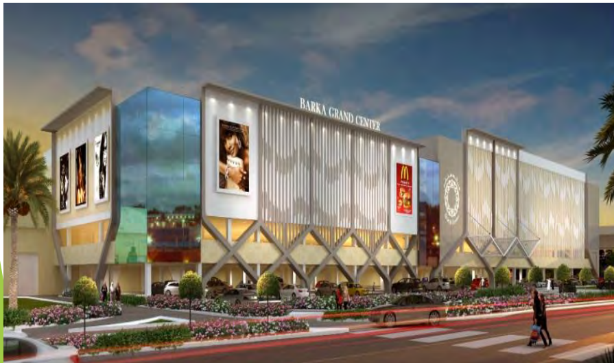
Construction of Barka Grand Center & WOW Cinema at Barka – USD 13.00 Million