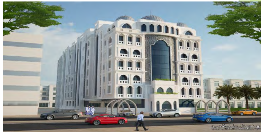
ALSERKAL BUILDING, RUWI