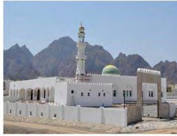
Mosque at Sibal, Wadi Tayeen – USD 2.08 Million