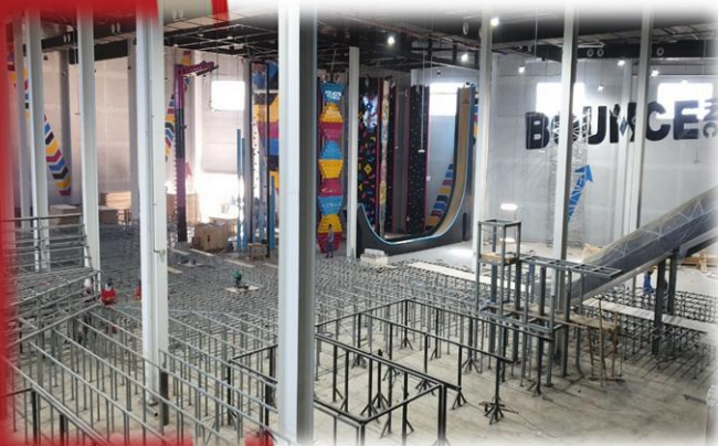
Fabrication & Erection of MEP Supports for M/s BOUNCE INC (Oman)