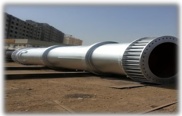
Fabrication & Erection of 90m Height Stack for M/s SOHAR STEEL LLC