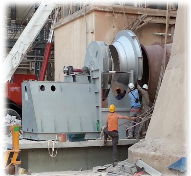
Replacement of Kiln shell , Girth gear , Tyre, Rollers, Cowl shell for LINE# 2 M/s RAYSUT CEMENT CO.