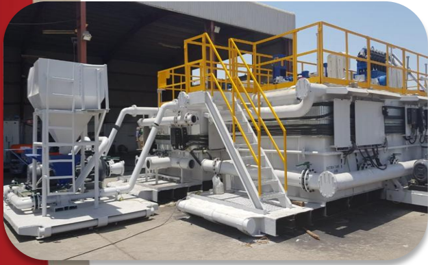
Suction Tank Refurbishment works for M/s ABRAJ ENERGY SERVICES