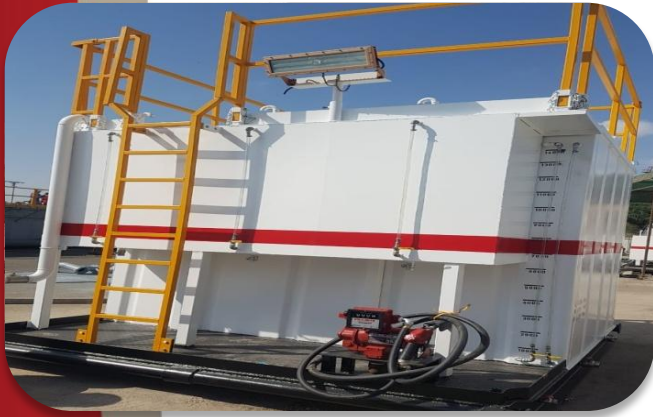
Fabrication of Diesel Tank for M/s AL SHAWAMIK OIL & SERVICES