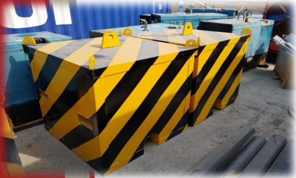
Fabrication of Anchor Blocks for M/S AL SHAWAMIK OIL & SERVICES