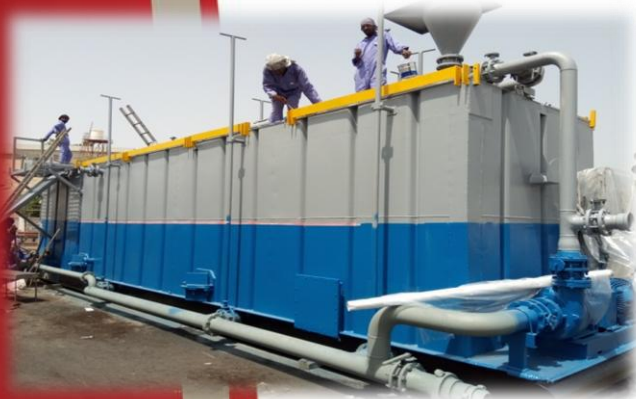
Repair & Maintenance works of Mud tanks for MB PETROLEUM SERVICES