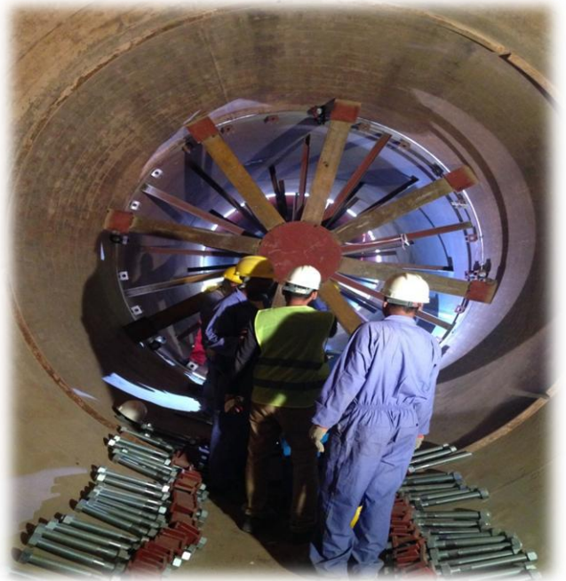
Replacement of Kiln shell , Girth gear , Tyre, Rollers, Cowl shell for LINE# 2 M/s FLSMIDTH , OMAN CEMENT CO.