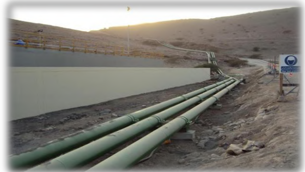
Fabrication & Installation of Fresh Water line Distribution for M/s Oman Cement SAOG