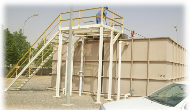
Fabrication of Storage Tank for M/s OWATCO SAOC.