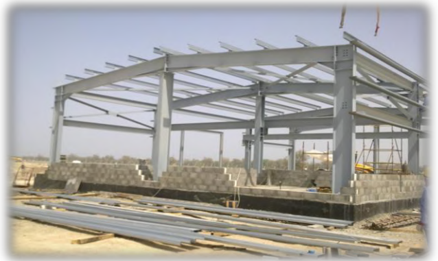
Fabrication & Erection of RO Building and other Buildings for M/s NCC International