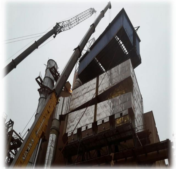
Dismantling of LINE#3 Existing ESP and Conversion to New Bag filter for M/s CTP , Italy , RAYSUT CEMENT CO.SAOG