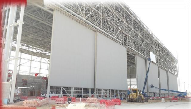
Fabrication & Erection of Air Craft Hangar Doors for M/s JEWERS DOORS, UK