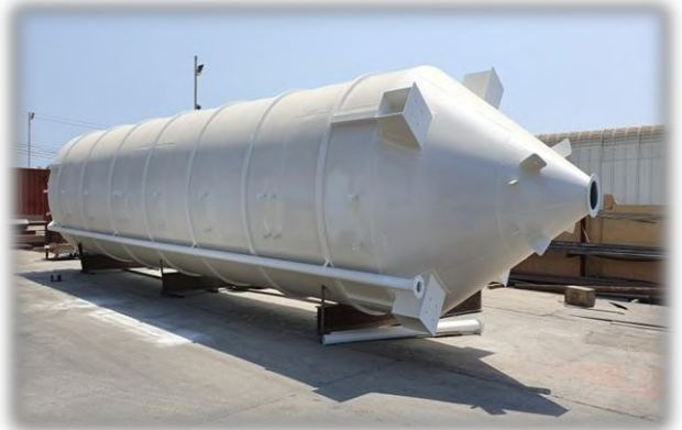
Fabrication of Steel Silo for M/s Muscat Steel Industries