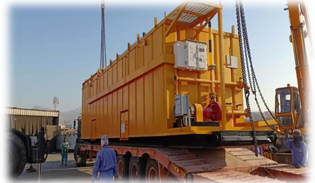
Maintenance of Reserve Tank for M/s AL SHAWAMIK OIL & SERVICES