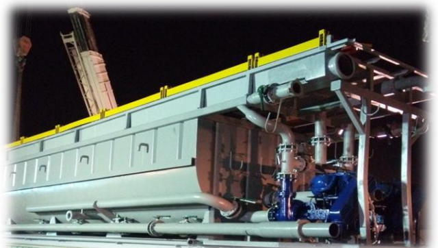
Maintenance works of Mud Tank for M/s ABRAJ ENERGY SERVICES