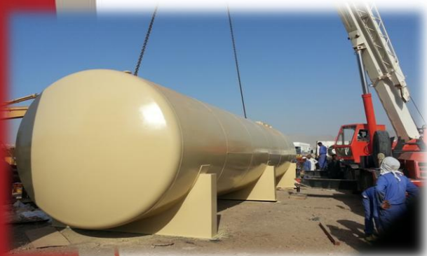
Fabrication of Storage Tanks for M/s JINDAL SHADEED