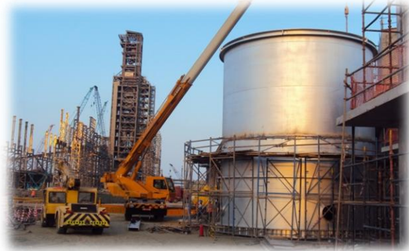
Fabrication & Erection of 8m Dia * 64m Height Stack for M/s Jindal Shaded