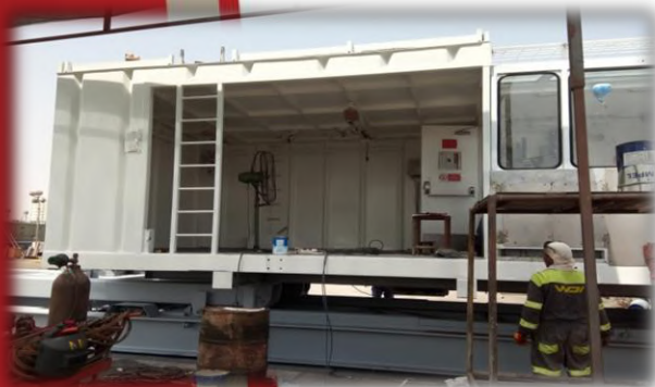
Maintenance works of Dog house for M/s ABRAJ ENERGY SERVICES