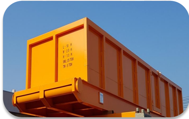
Fabrication of Tool Bin for M/s AL SHAWAMIK OIL & SERVICES