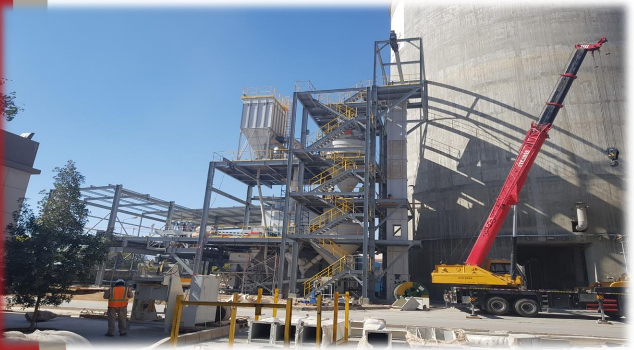
Construction of Oman's First Auto Cement Packing Plant for M/s RAYSUT CEMENT Co.SAOC , Salah