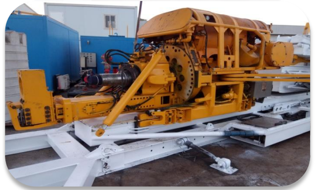
Top Drive Repair and Maintenance works for M/s ABRAJ ENERGY SERVICES