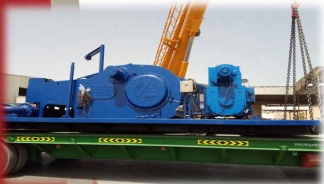
Maintenance works of Mud Pump for M/s ABRAJ ENERGY SERVICES