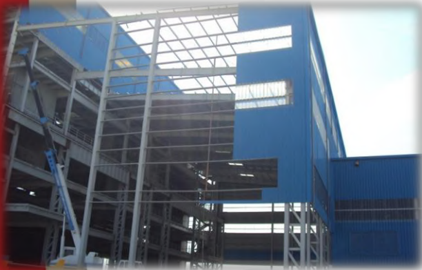
Fabrication & Erection Steel Structure for L&T Heavy Engineering SOHAR