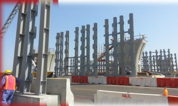
Fabrication & Erection Gantry Structures for M/s NCC International