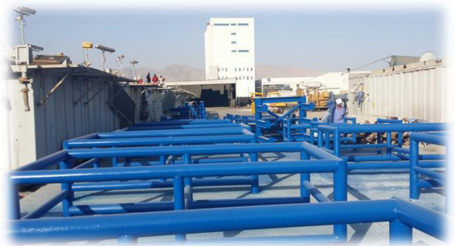
Fabrication of skids for M/s ABRAJ ENERGY SERVICES