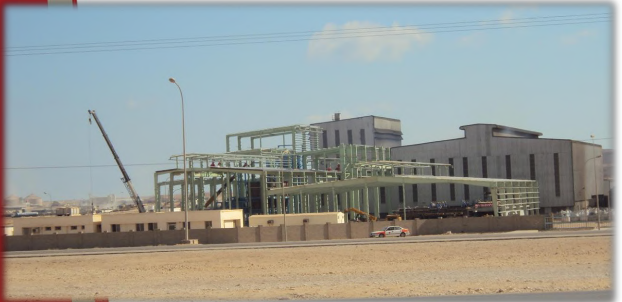
Construction of New Brake Parts Manufacturing Unit for M/s Dunes Oman , Salah